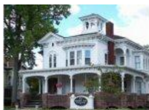
Robert L. Yost Funeral Home, Inc